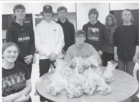
Pictured above: MHS Foods 2 classes baked yeast rolls to be distributed by the Community Center of Hope food pantry.