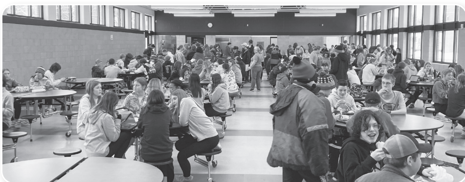
Pictured above: Eighth grade students are enjoying lunch in the new cafeteria.